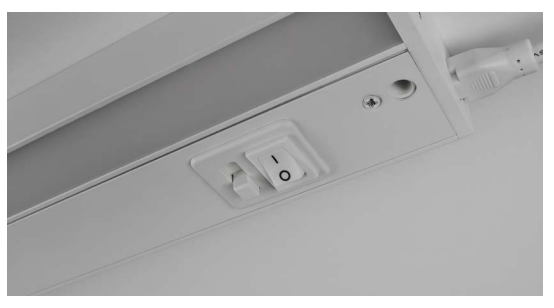
Standard three selectable CCT 3000K, 3500K, 4000K